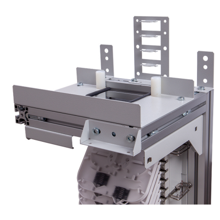
MDO 300 Roof