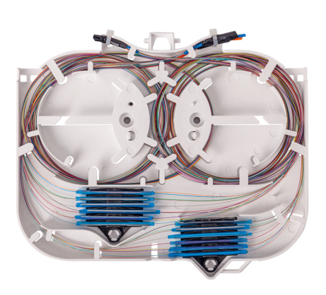
KM 4 (for splicing, up to 24 splices)