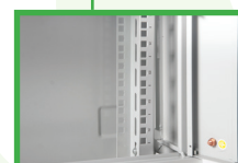
Height marked 19" frame