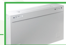
Mounting plate, for easy on wall installation.